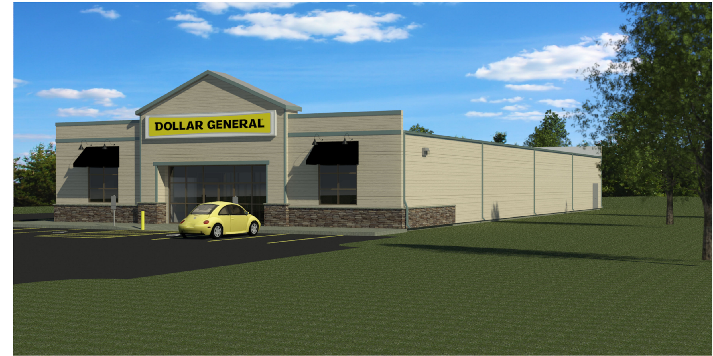
3 EXTERIOR RENDERING 2 A201 12" = 1'-0"