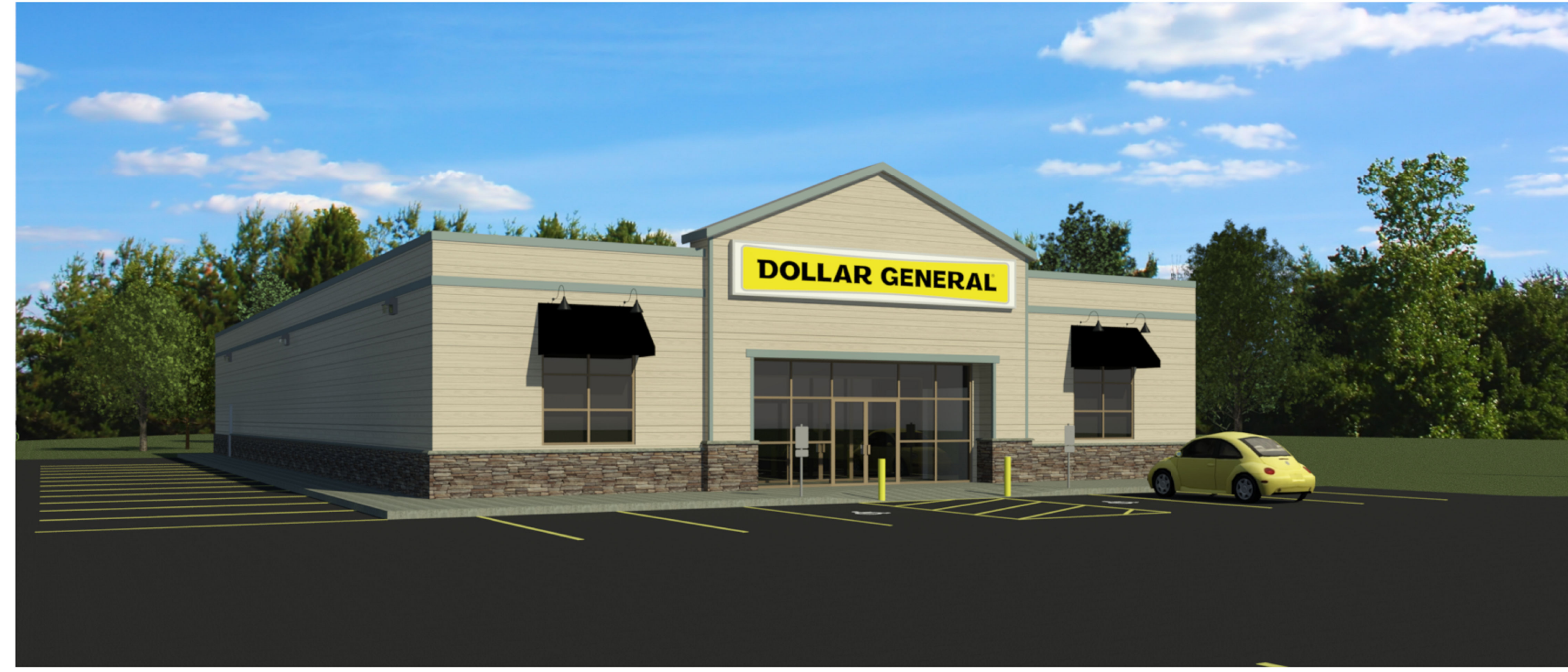
2 EXTERIOR RENDERING A201 12" = 1'-0"